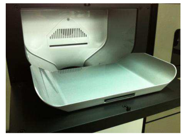
Open the loading door of the VRS – Casa. Close the loading door.