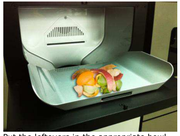
Put the leftovers in the appropriate bowl.