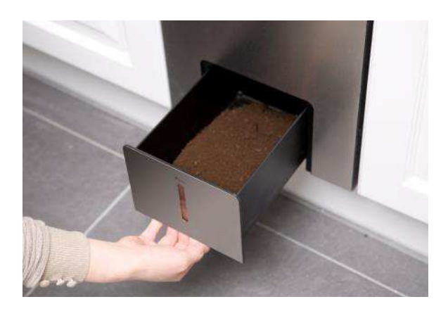
The result is an excellent organic fertilizer.